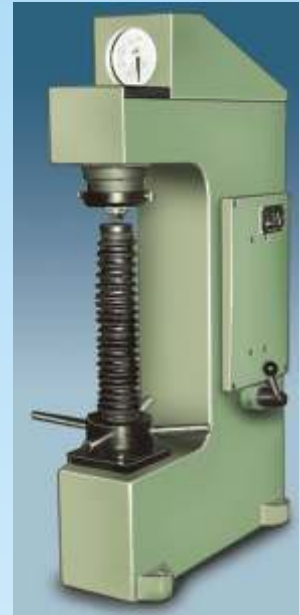
Model : RAB-250