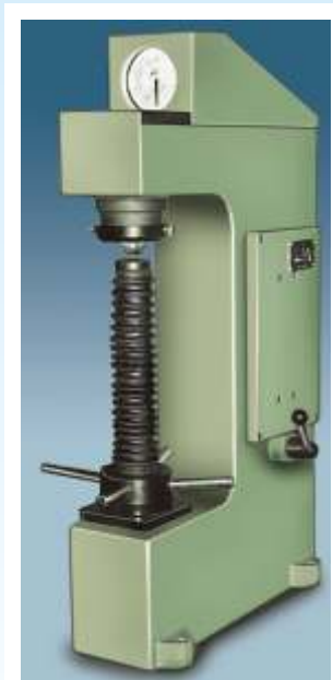
Model : RAB-250

ROCKWELL, ROCKWELL BRINELL COMBINED, ROCKWELL/ROCKWELL SUPERFICIAL COMBINED SYSTEM HARDNESS TESTERS