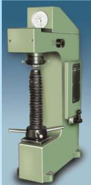
Model : TWIN