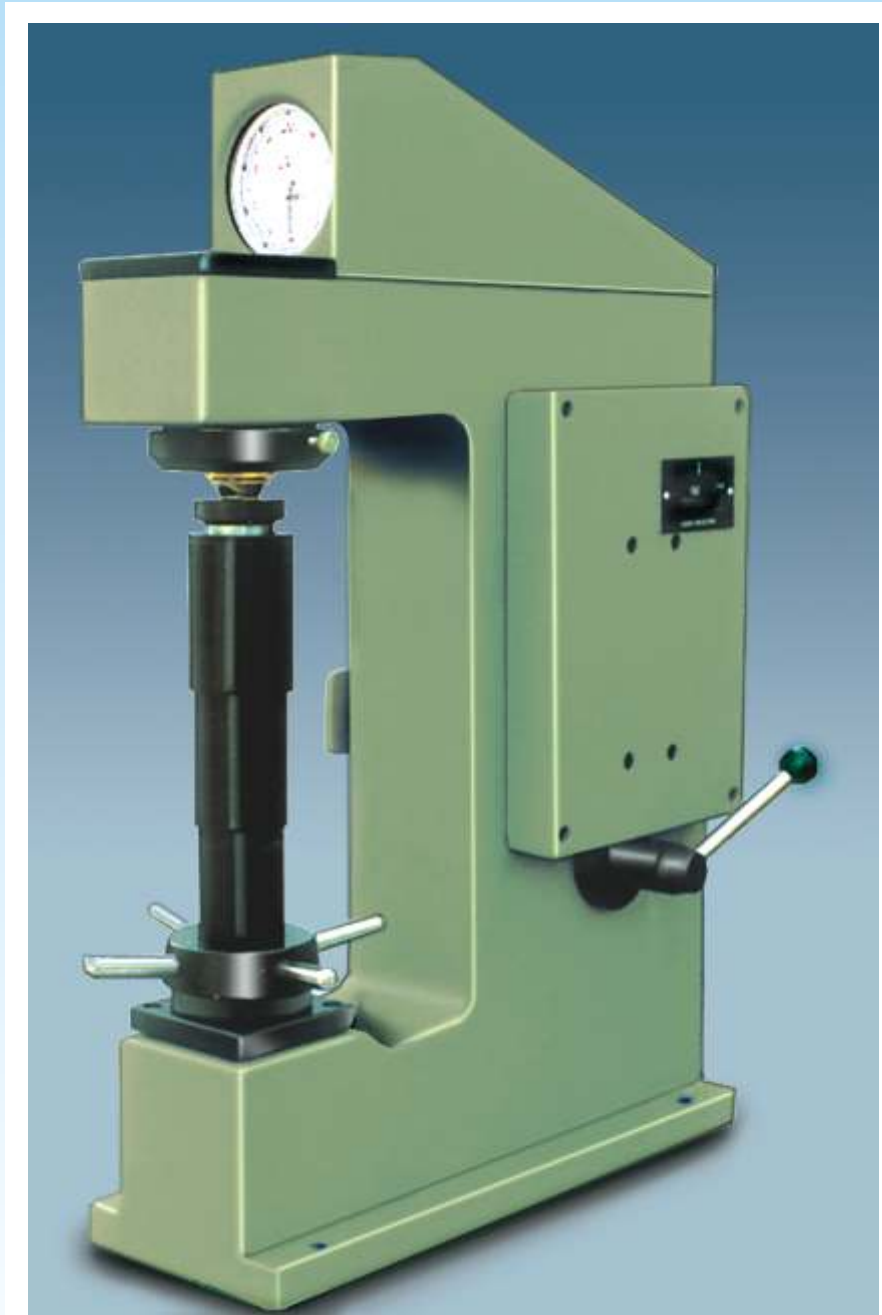
Model : RAS