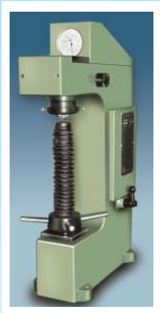
Model : TWIN