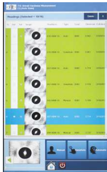
Readings with Impression Window

FIE reserves the right to change the specifications without notice due to constant improvement in design.