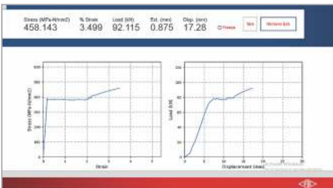
Real Time Graph