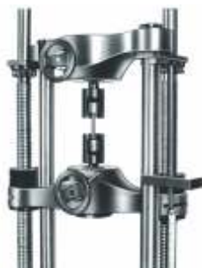
Attachment for Tension Test of - Shouldered & Threaded specimens upto M6 to M20 (Min. length 110 mm).