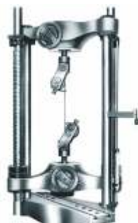
Attachment for Tension Test of - Wire Ropes (Min. Ø1 to Ø10mm)