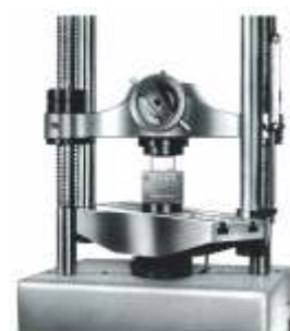
Shear Test (Min. Ø5 to Ø20mm) & (Min. Ø25 to Ø40mm)